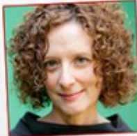
Linda Solomon-Wood @Linda_Solomon National Observer